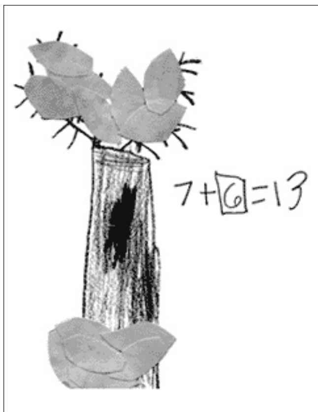
Figure 2. Aaron saw the leaf-blowing situation as an addition problem.